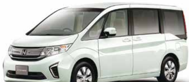
HONDA STEP WGN or equivalent