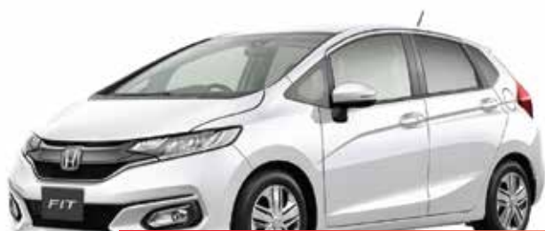
HONDA FIT or equivalent