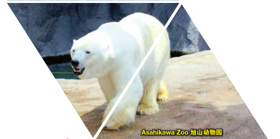
Asahikawa Zoo 旭山动物园