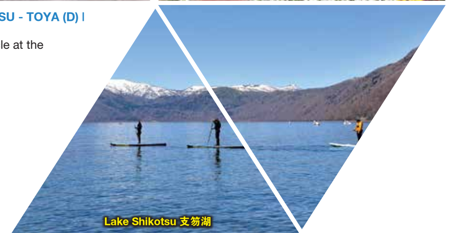
Lake Shikotsu 支笏湖