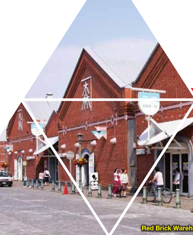
Red Brick Warehouse 金森红砖仓库

GROUND ARRANGEMENT | (T/C: GA-JHA) SELF DRIVE | UPDATED: 28NOV2018