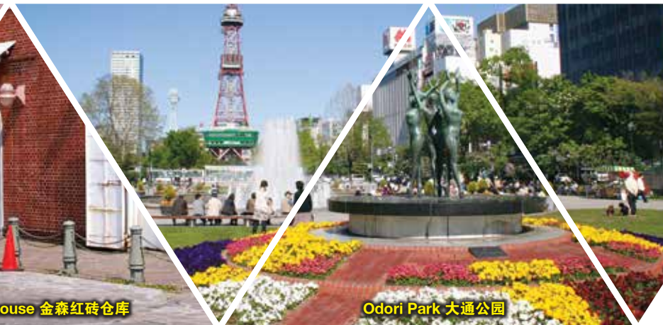
Odori Park 大通公园